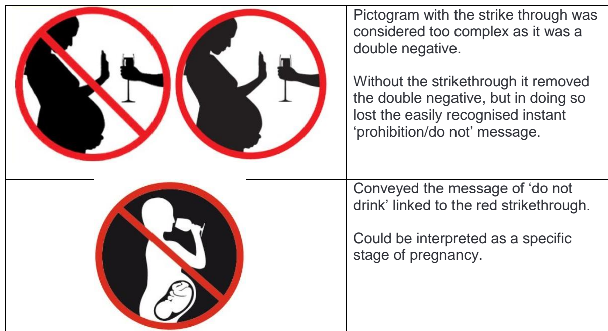
Table 2: Comprehension of alternate pictograms and warning statements

Hall & Partners (2018) also tested a range of alternate pictograms and warning statements.. A brief summary of the comprehension findings from these is at Table 2.