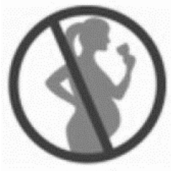
Figure 1: Standard pictogram

The standard pictogram refers to the pictogram with a silhouette of a pregnant woman holding a drinking glass enclosed within a circle with a diagonal strikethrough (Figure 1). The standard pictogram may come in various colour combinations (e.g. black with red strikethrough, monochrome, greyscale). The standard pictogram is used as part of DrinkWise Australia and Cheers voluntary warning label initiatives.